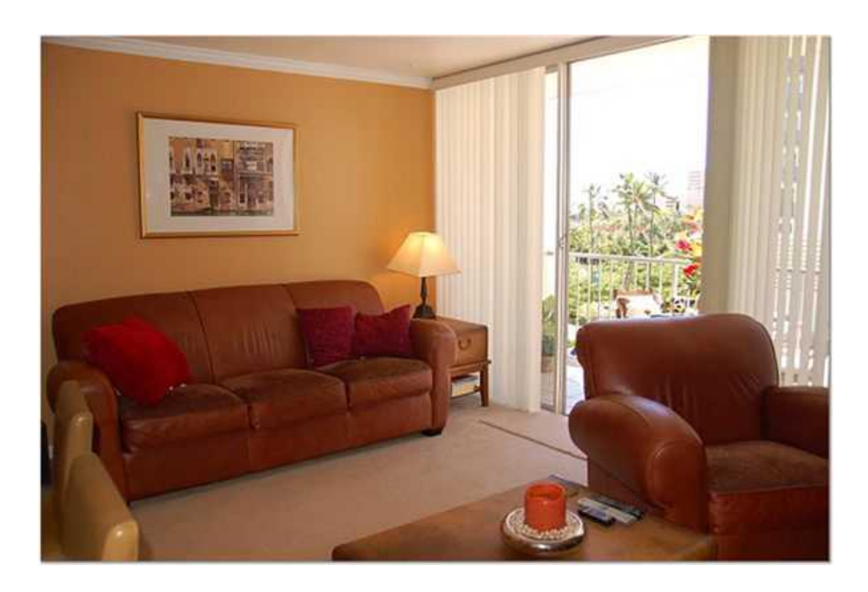
LIVING ROOM AND LANAI