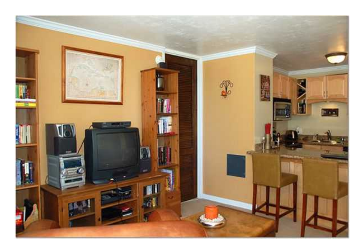
LIVING ROOM AND EATING AREA