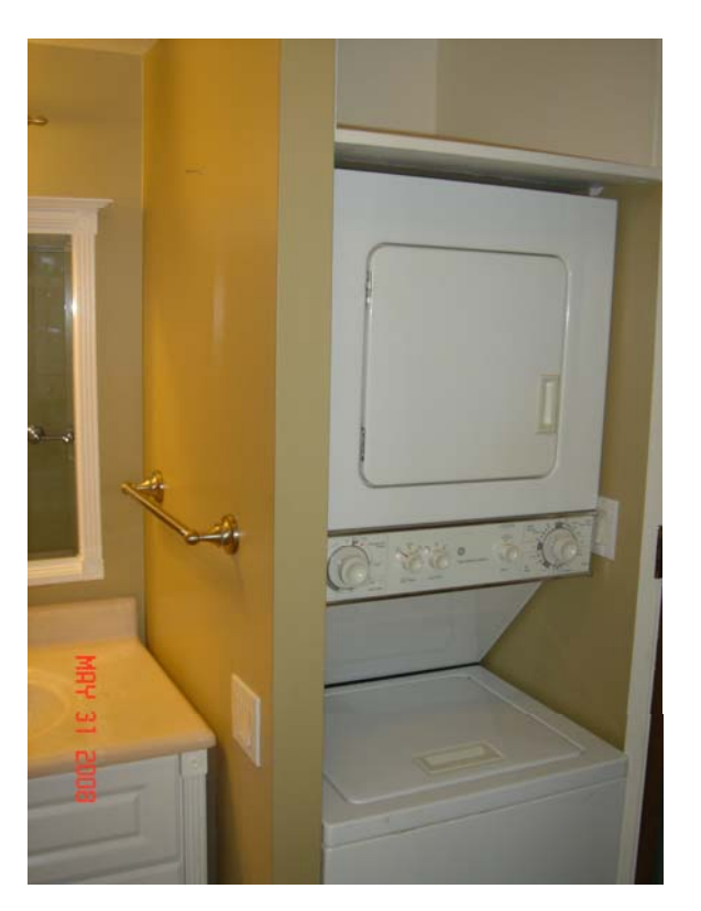
CLOTHES WASHER & DRYER