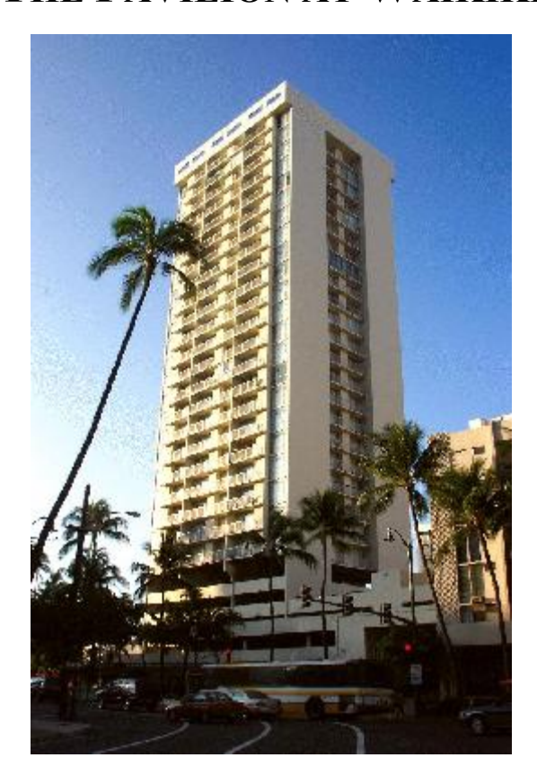
1925 Kalākau'a Avenue Honolulu, Hawai'i 96815

The Pavilion At Waikīkī is an up-scale condominium property at the intersection of Kalākau'a Avenue and McCully Street, at the gateway to Waikīkī. Within easy walking distance is Waikīkī Beach, Ala Moana Shopping Center and the Hawai'i Convention Center, near Ala Wai Golf Course on the edge of historic Fort DeRussy. Building amenities include a swimming pool, sun deck, recreation area, and sauna on the roof (29th floor) as well as shopping and restaurants on the ground floor.