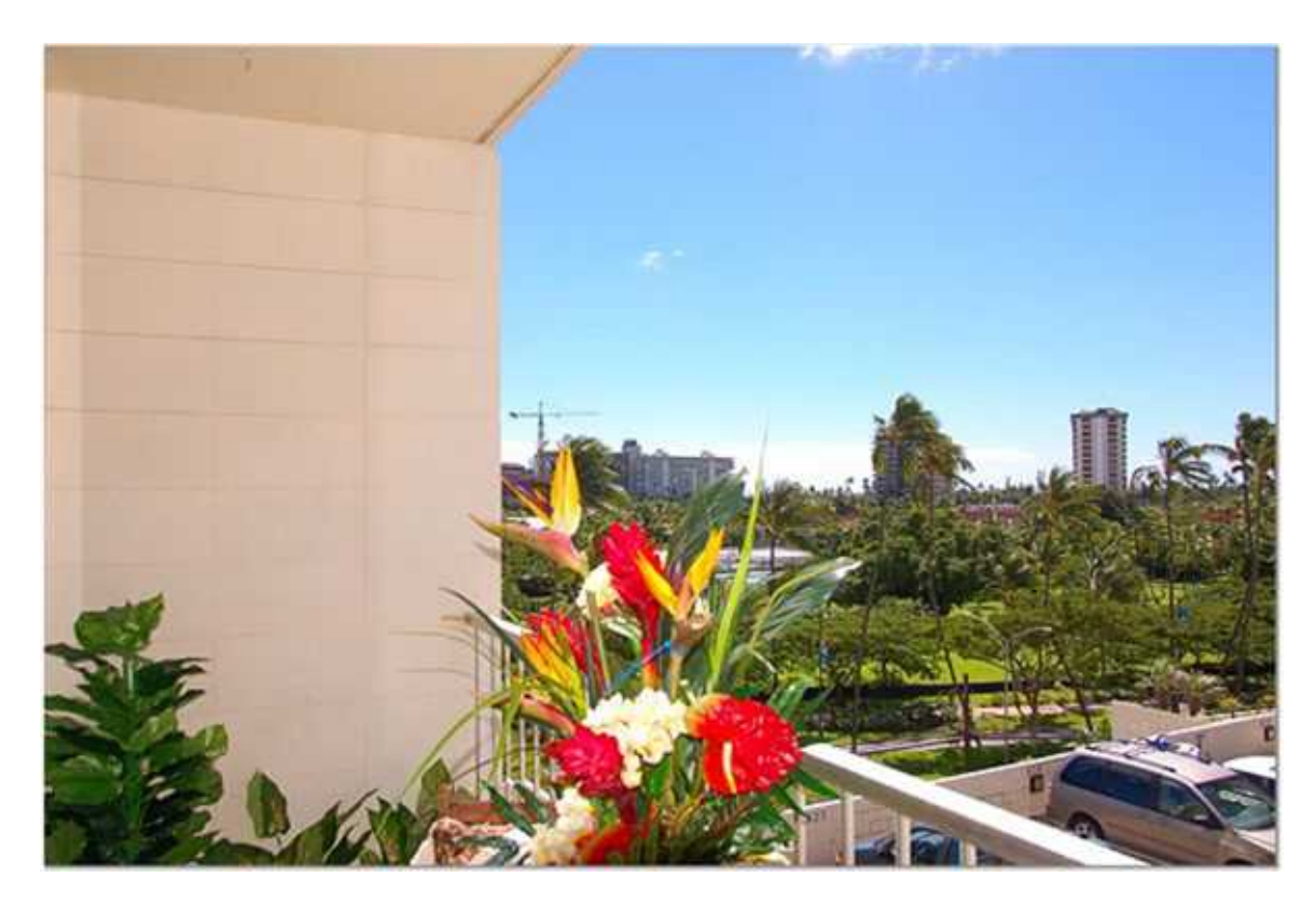
VIEW FROM THE LANAI OF FORT DERUSSY AND WAIKĪKĪ